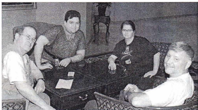
The 2008 DSC Hearts Championship of the Known Universe was